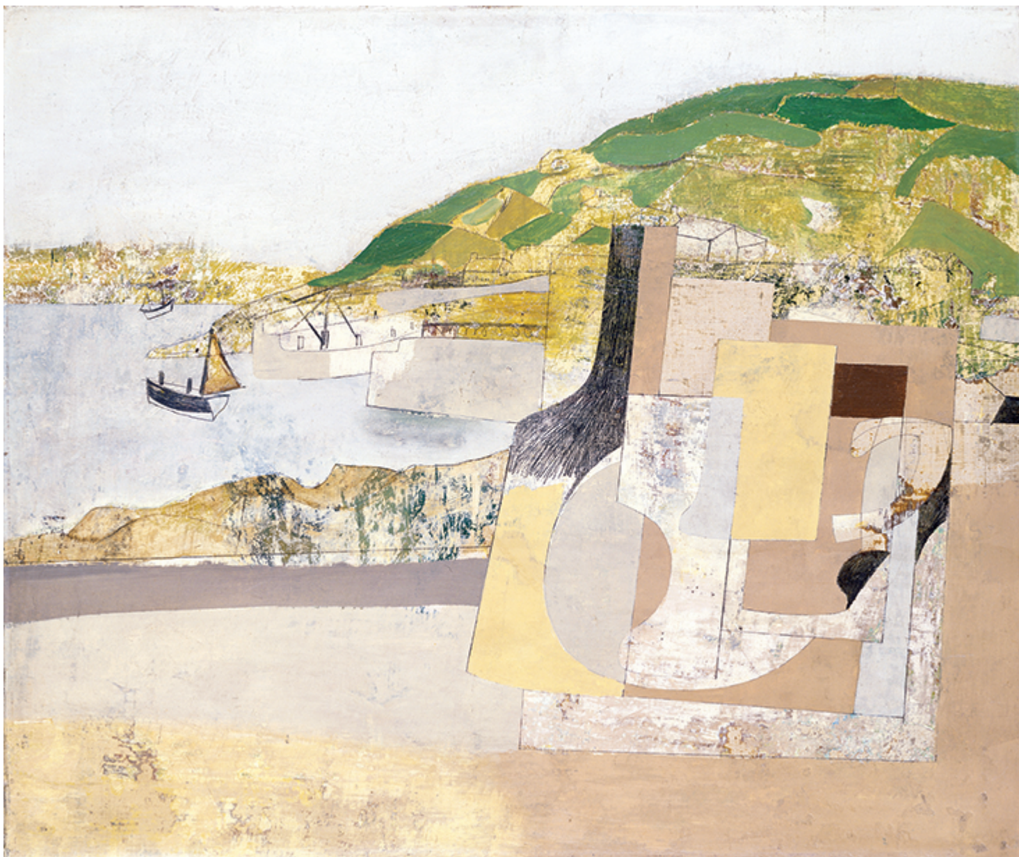
Mousehole/ Ben Nicholson / 1947

KRISTA NATURAL linen has the creamy freshness of homemade custard or Cornish cream. British painter Ben Nicholson brought this colour's glowing light into his carefully structured, minimal canvases and relief sculptures, investing them with an intimate warmth that seems somehow instantly familiar. Whether portraying landscapes, interiors or still life subjects, his artworks were an exercise in order and restraint, exploring how the essence of an object or place could be described with the barest amount of information, distilling it down to its skeletal bones. "Realism has been