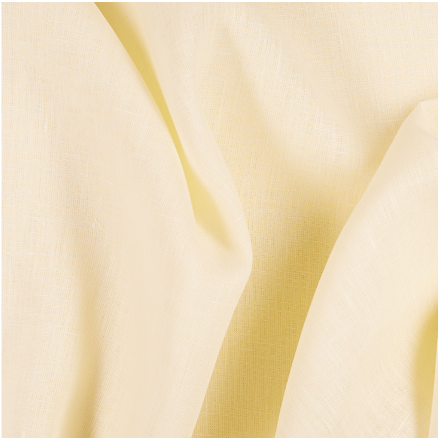
FS KRISTA NATURAL Softened 100% Linen

abandoned in search for reality” he writes, “the principal objective of abstract art is precisely this reality.”