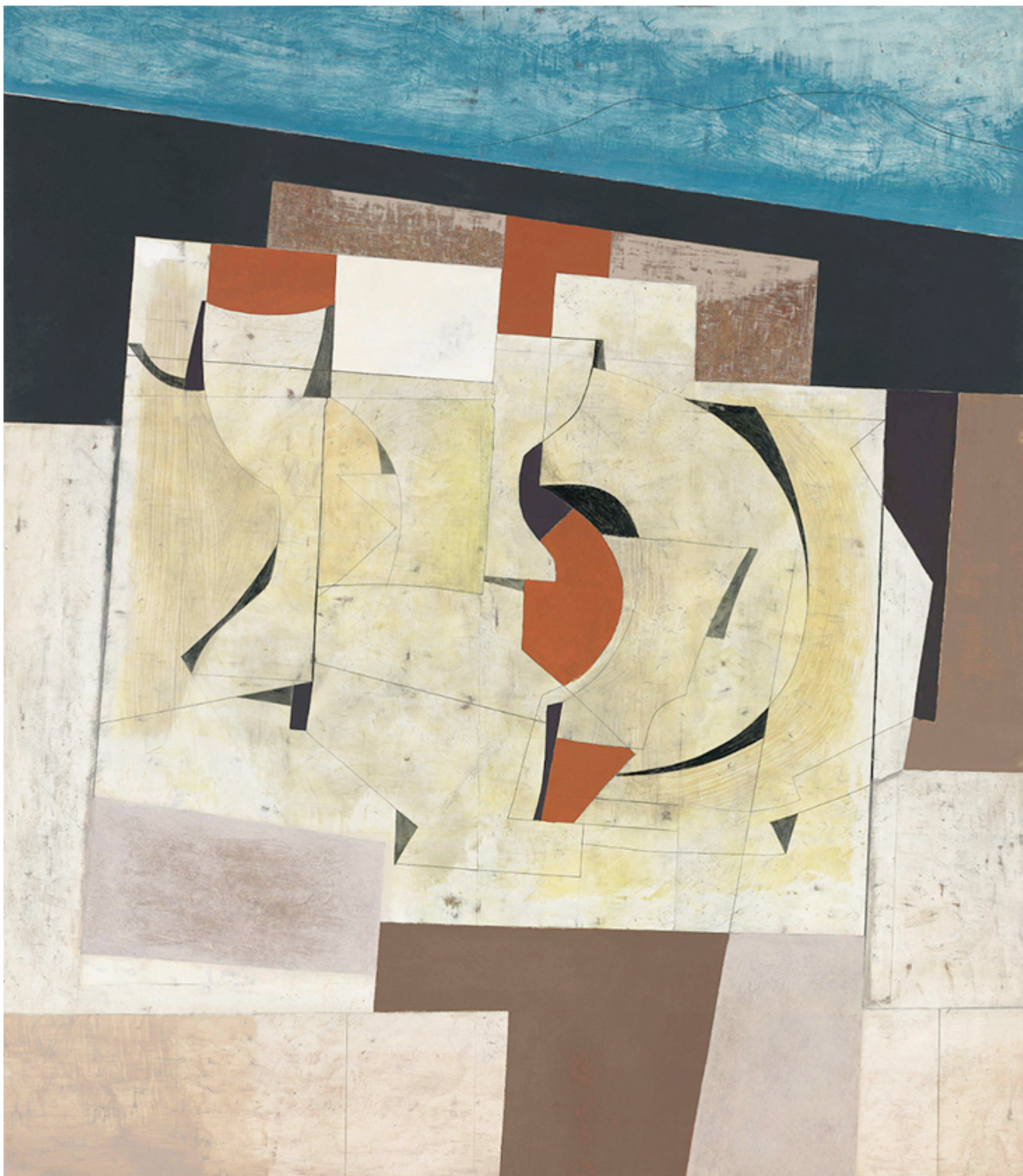
April 57 (Arbia 2) / Ben Nicholson / 1957